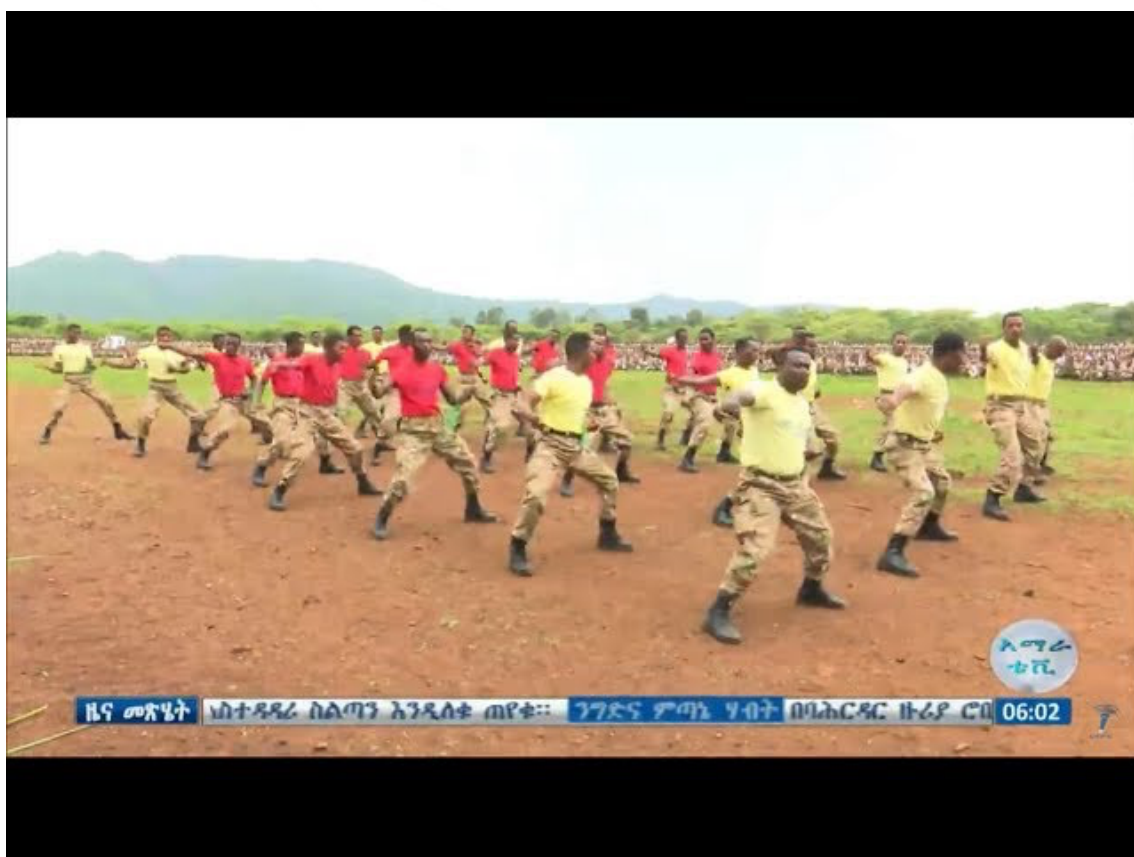
Picture: Amhara region special police graduation ceremony

Until recently, regional states were left with a broad discretionary power to establish a regional police force. There was no guidance or national standard on the type of police institution, structure, training, and weaponry the regional state police institutions needed. This led to the evolution of inconsistent practices within regional states. 44 Similar to the army, regional special police forces are organized in divisions, battalions, and squads. Across the board these special police forces resemble more closely the defence forces than any type of conventional police. If there is any difference, it is only in the name or the uniforms they wear, and as more and more former army officers join the ranks of special police forces, lines between the two are becoming increasingly blurred. Reflecting the transformation in its role, some regional states like Tigray have abandoned the name special police. Since January 2021, for example, the Tigrayan special police was renamed to the TDF. In Oromia and Amhara, the preferred term remains Liyu Hayle , or “special force.”