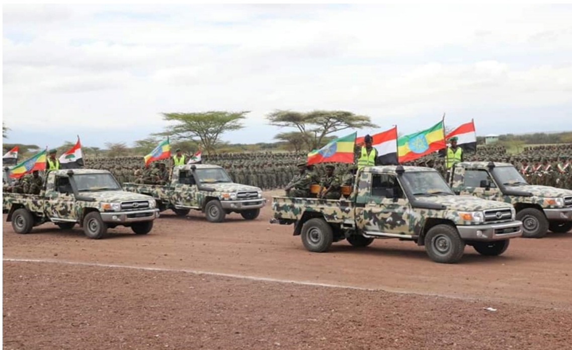
Picture: The Special Police Force of the State of Oromia, Parade at Bulbula Training center

conducted by the federal defence forces stationed there; in other regional states, it is given either by the federal defence force or the heads of the regional special police. While there is an upper age limit for the recruitment of regular police, this requirement is waived in the case of special police to attract retired army generals and officers.