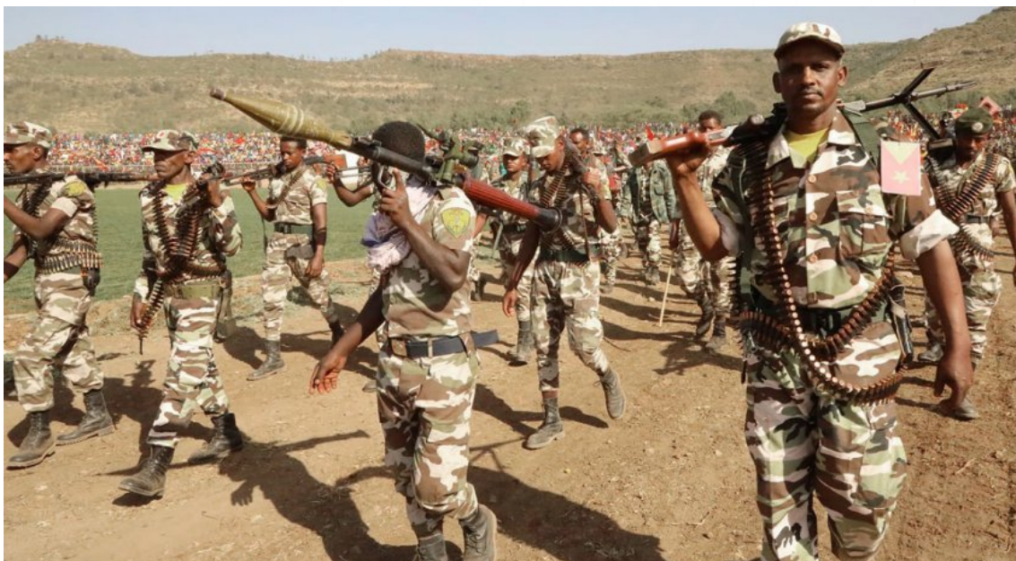
Picture: Special Police forces in Tigray, now known as the Tigray Defense Force (TDF)

The consequences of the availability of this weaponry cannot be understated. In a March 2021 interregional state conflict between Afar and Somali communities, an international media outlet reported, "Somali special forces returned with truck-mounted firearms and rocket-propelled grenades to Haruka and two nearby areas, killing an unknown number of civilians, including women and children, in their sleep." 49