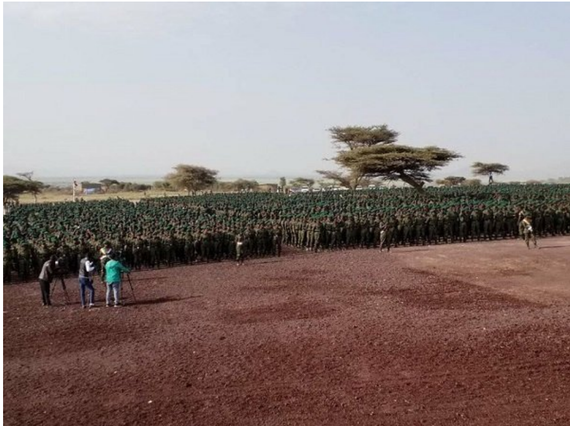
Picture: The graduation of Oromo special police forces

There are many similar reports about the "successful completion and graduation" of special police. Training is done regularly; Oromia announced its 31 st round in May 2021. All regional states conduct such training, but not all make such public announcements. According to some sources, the size of the Oromia special police is close to 100,000. In the Amhara region, it is estimated to be 60,000 (this number may have increased with the war between the federal government and the Tigray Defense Force now expanding into the Amhara region). 40 Other regional states are estimated to have a smaller number than the special police figures for Amhara and Oromia, but all states have established special police forces. 41