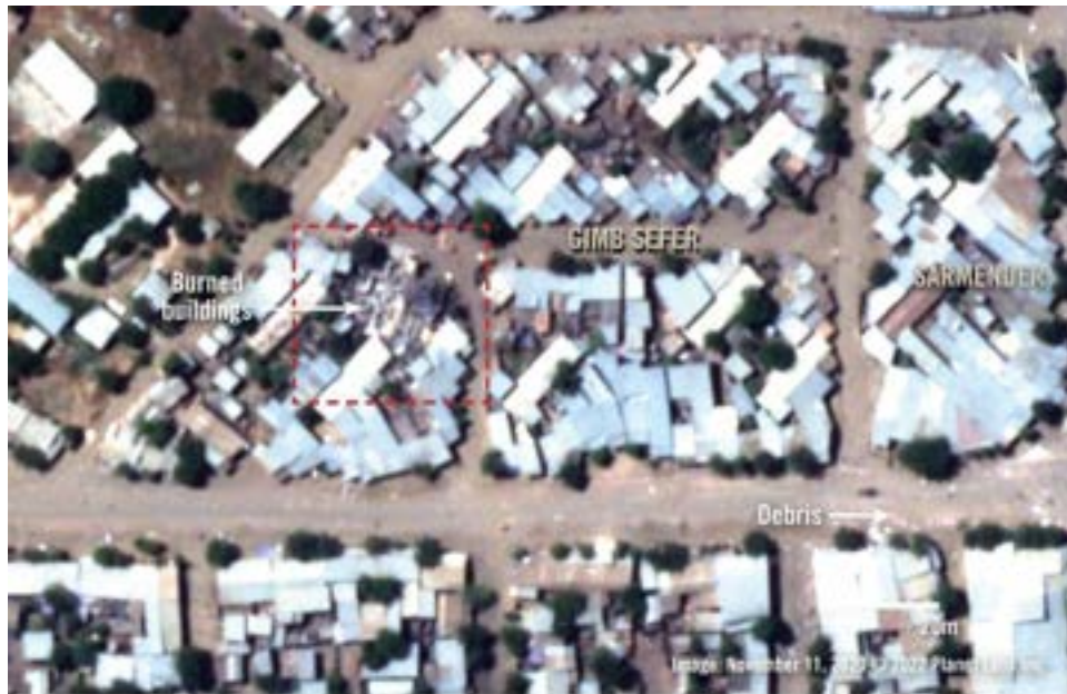
Satellite imagery from 20 November 2020 shows a closer look at one area of major damage in Mai Kadra. The buildings – circled in red – were damaged between 9-10 November 2020 according to low resolution imagery (not shown). Debris is also visible along the road.