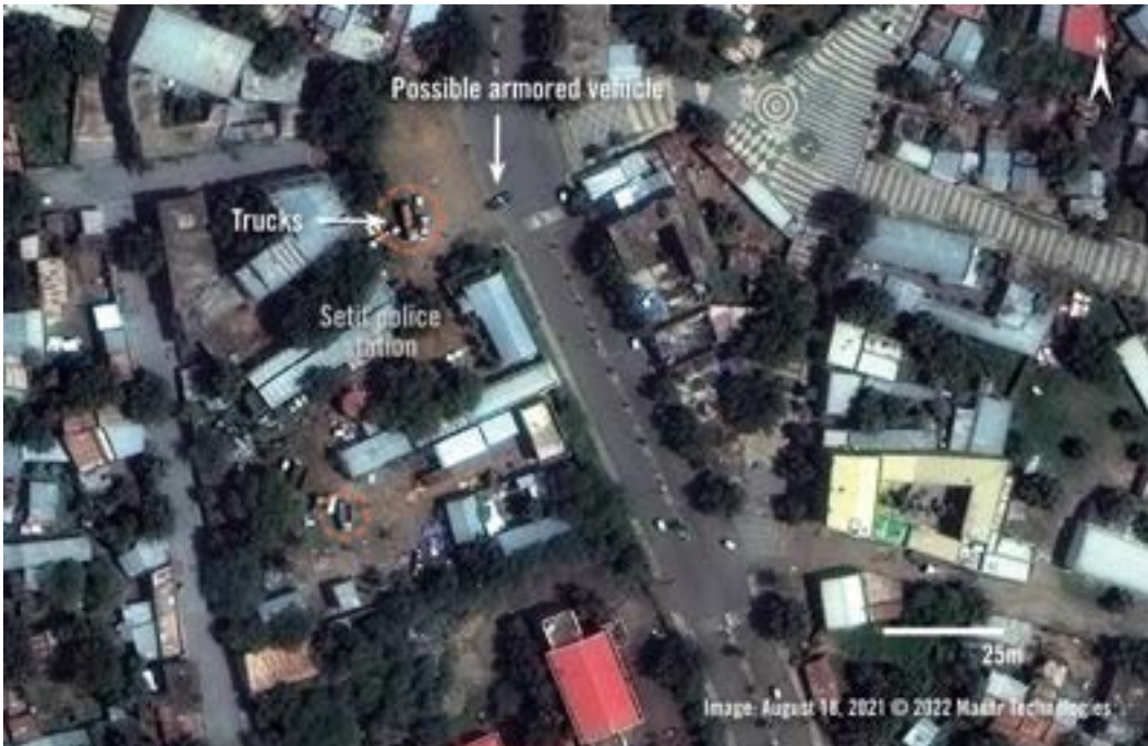
Satellite imagery from 18 August shows a couple of lorries and a possible armoured vehicle at the Setit police station in the centre of Humera. Activity with vehicles moving and objects shifting is seen at the police station throughout imagery collected in late 2020 and 2021.