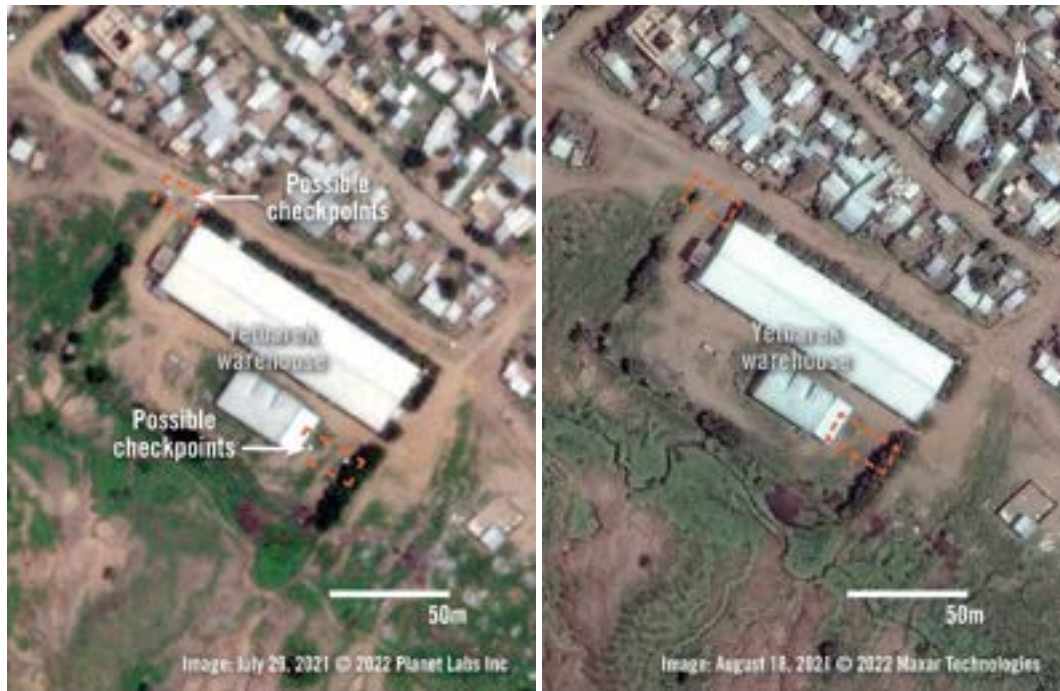
Four small white objects are visible at the entrance and back area of the Yetberek Warehouse in imagery from July 29, 2021. The objects are also visible on July 30 and August 2 (not shown) suggesting they could be checkpoints for movement into and around the warehouse area. The objects are not visible in imagery from August 18, 2021.

A detainee at Enda Yetberek, said that one detainee died from complications after the guards beat him in retaliation after he attempted to escape: “They beat him, and he wasn’t able to eat or drink anything for two weeks and [he] died.” 802 He added that guards at Enda Yetberek would wait for days to remove dead bodies from detention cells or at times force other detainees to do it: