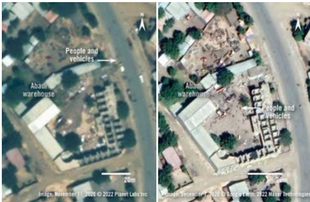
Imagery from 11 November 2020, shows people and vehicles along the road outside of Abadi warehouse. On 7 December 2020, imagery shows many people and some vehicles present within the Abadi warehouse area.

Amhara Regional Government, which described the events of Mai Kadra as “dreadful crimes committed by the ... TPLF.” 196 The Amhara authorities claimed that “members of Samri (youth groups assigned for the massacre), with the help of the Tigrayan police and militia ... slaughtered more than 1,600 innocents” at Mai Kadra. Their figure, however, does not tally with victim counts found in the Joint EHRC - UNHCR Investigation Report and in the reporting of the Ethiopian Federal Police Commission. The Amhara Regional Government also declined to respond to our specific questions concerning the events of Mai Kadra and was silent regarding reprisal attacks targeting Tigrayan residents of Mai Kadra.