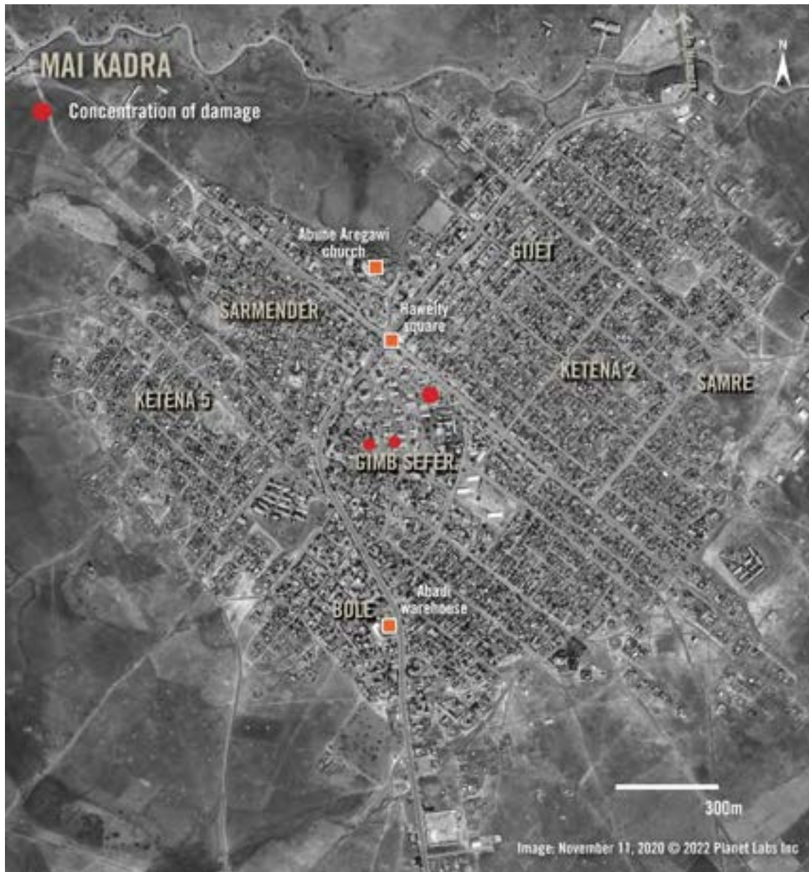
Satellite imagery shows an overview of Mai Kadra on November 11, 2020. Areas with significant damage are highlighted in red, and locations of areas of significant events in November and December 2020 – including the reported detention of Tigrayans in Abadi warehouse – are marked with orange squares.

By 2018, these tensions led to mobilization along ethnic lines in certain neighborhoods in Mai Kadra. “There were different signs that people were forming in groups, a Tigrayan group, Walqayte group, Amhara groups. Small groups of people, but divided by ethnicity,” recalled Abrehet. 207