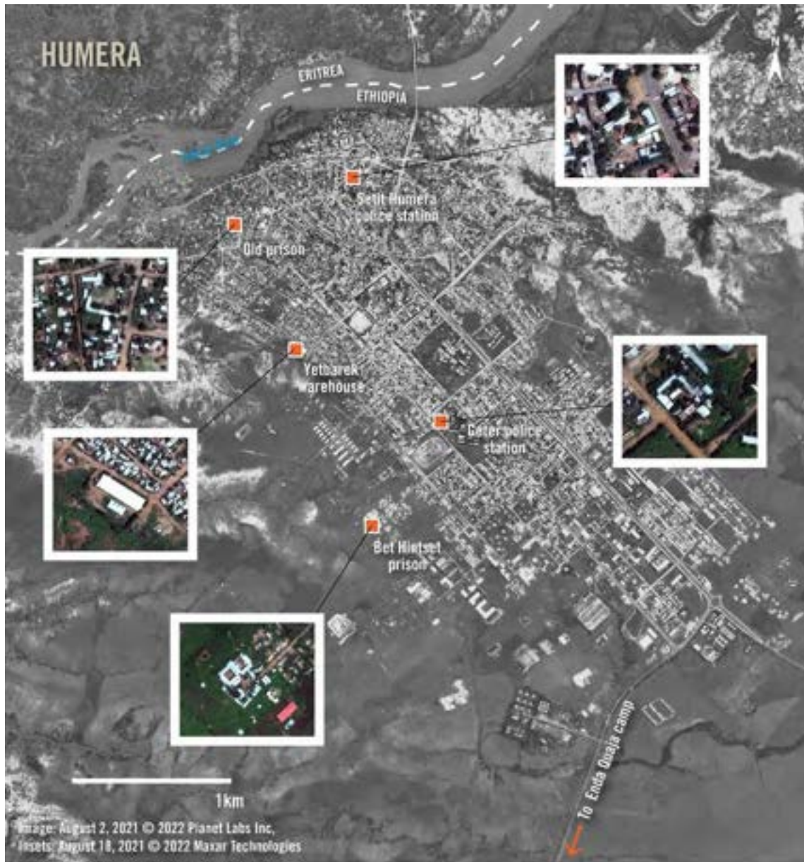
An overview of Humera from 2 August 2021 shows the areas where people reported being detained in the town.