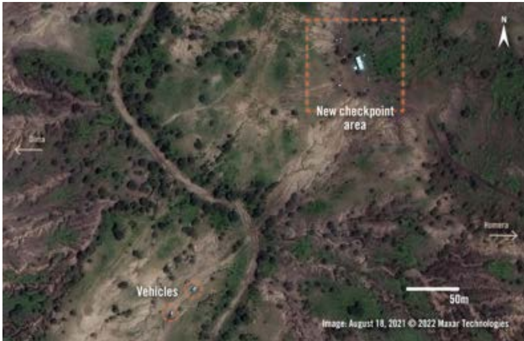
Imagery from 18 August 2021, shows a new structure with perimeter at a key crossing point during the rainy season, between Humera and Dima. Two vehicles appear to be moving toward the checkpoint from the west. Low resolution imagery (not shown) indicates that the perimeter and structure became visible between August 5 and 18, 2021.

By January 2021, Ethiopian federal soldiers were no longer visible in Dima, the last stretch of the journey for Tigrayans fleeing to Sudan. But refugees in Sudan describe groups of Amhara Special Forces and Fanos waiting in ambush to intercept people on the move. Some of the people fleeing were detained on the way or turned back repeatedly by forces in the Dima area.