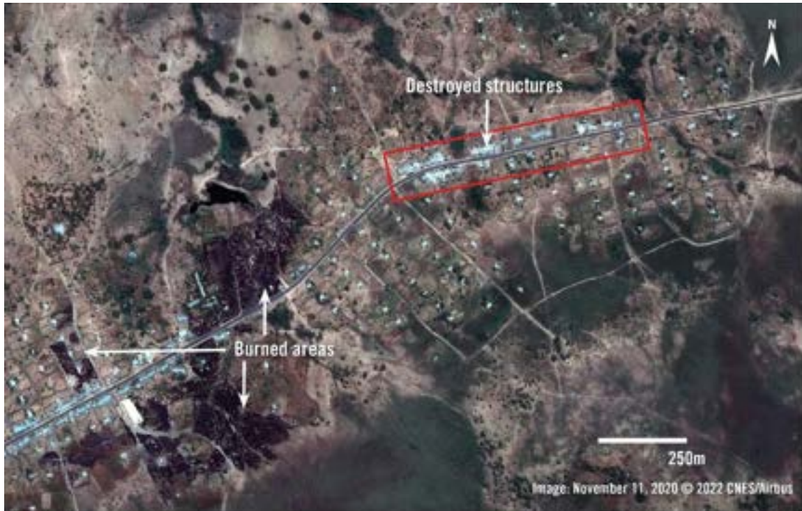
Satellite imagery from November 11, 2020 shows the eastern side of Division. Many structures along the main road are completely destroyed. According to low resolution imagery (not shown), the structures were damaged between November 5 and 10, 2020. Fires were detected in the area on November 7.

[They] said: “This is not your land! We own this place! Your land is on the other side of Tekeze. Go there! Live there! You can claim what you want there, but you have nothing to claim here.” Me and my friends managed to save materials from the roof, and then we went to the Amhara Special Forces and told them the Walqayte [were] stealing everything from the house. Instead of protecting us, the Amhara Special Forces took what we had salvaged from the house. 187