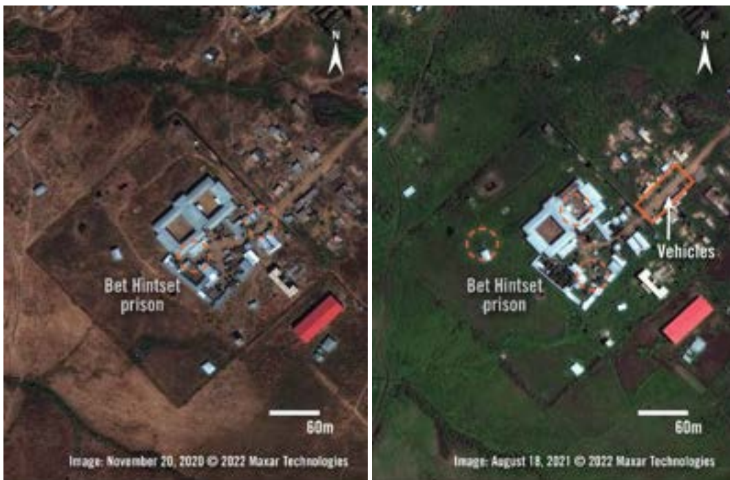
Satellite imagery from November 20, 2020 and August 18, 2021 shows the Bet Hintset prison in Humera. New debris is visible on both dates – circled in orange. On August 18, there are many vehicles visible outside of the prison gates.