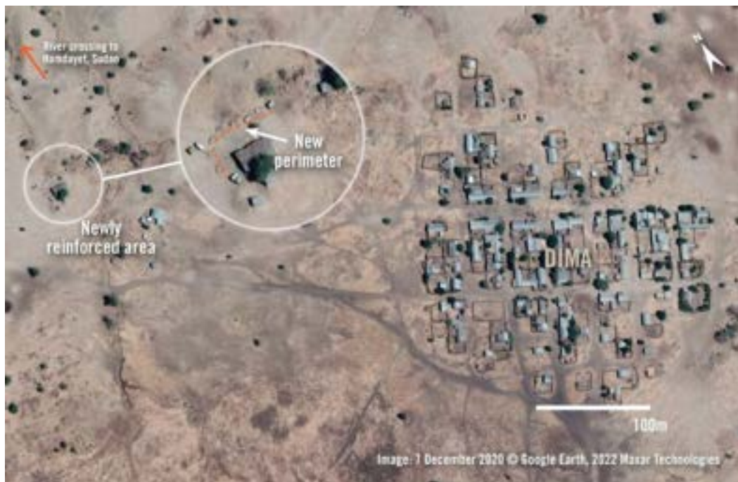
Satellite imagery from 7 December 2020, shows the Dima area where many people passed through to cross to Hamdayet, Sudan. There is a new perimeter surrounding some structures west of the village, on the path to the river.